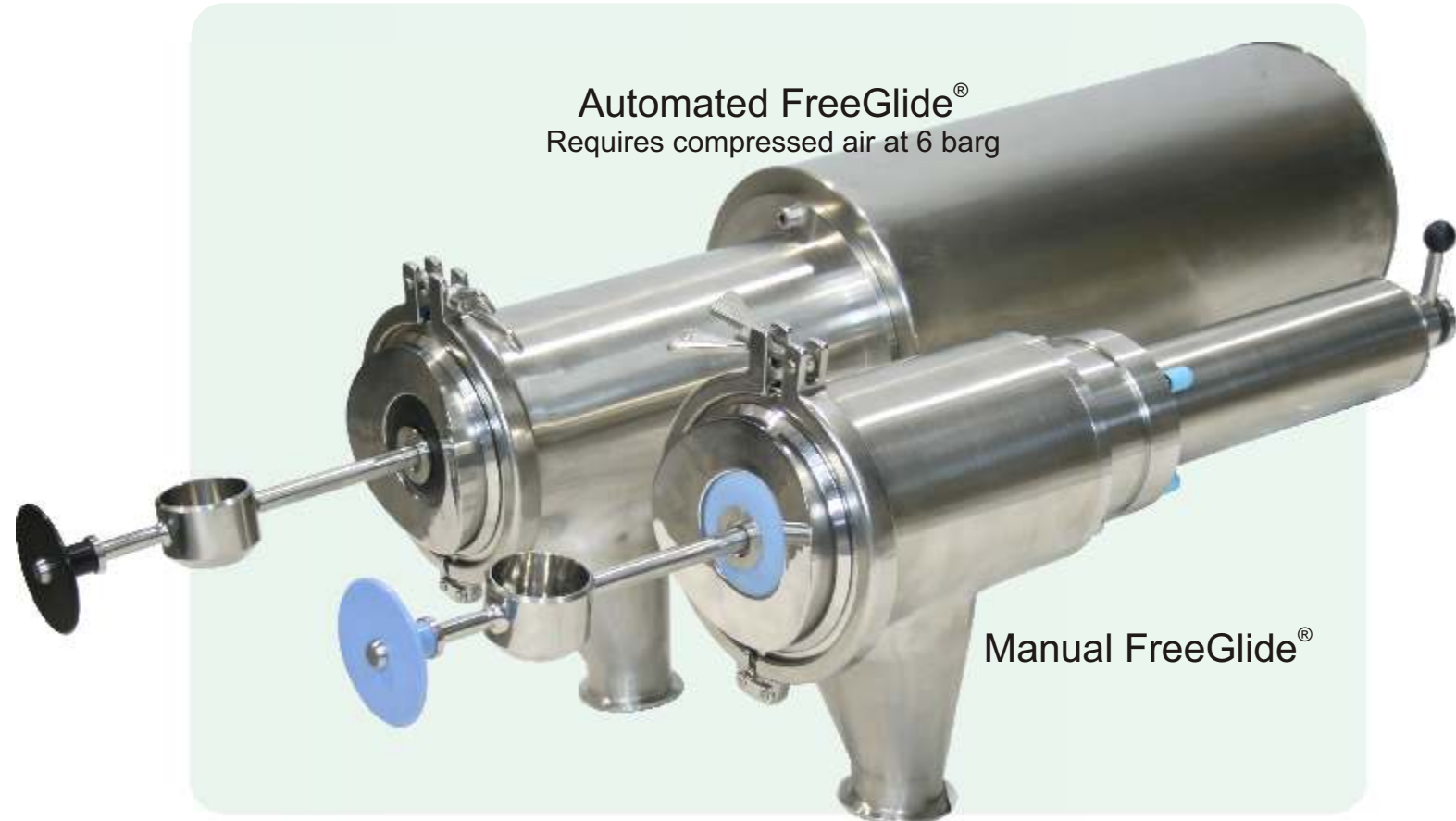
Automated FreeGlide® Requires compressed air at 6 barg

The FreeGlide is available with manual or automated actuation