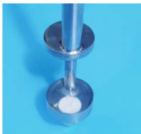
Tip in open position