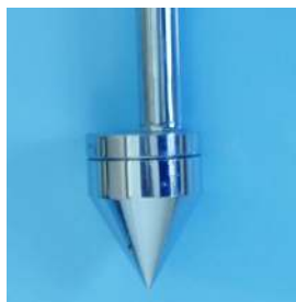
Tip in closed position